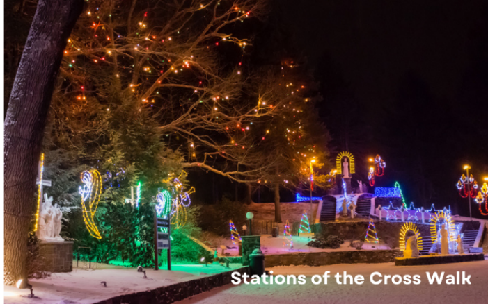
Stations of the Cross Walk