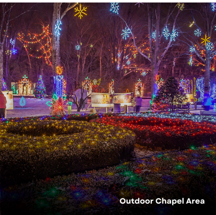
Outdoor Chapel Area

With more than one million lights, free admission, and a setting deeply rooted in the spirit of Christmas, the La Salette Christmas Festival of Lights stands as New England's largest religious Christmas display — a cherished tradition that draws families, parishes, and pilgrims from across the United States and a growing number from around the world. Are you ready to experience the wonder of Christmas in a whole new light?