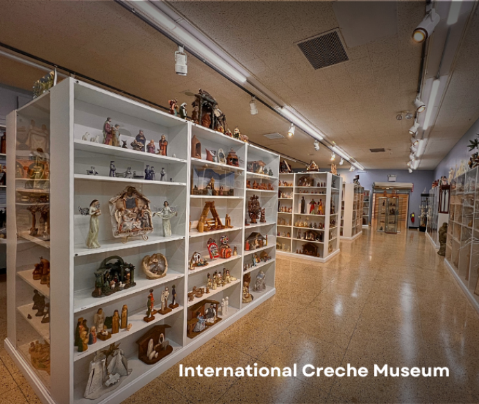
International Creche Museum